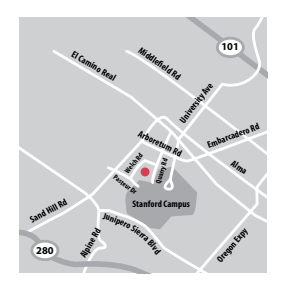
Packard Children's Hospital 725 Welch Road, Suite 391 Palo Alto, CA 94304

Perinatal Diagnostic Center (650) 725-7030